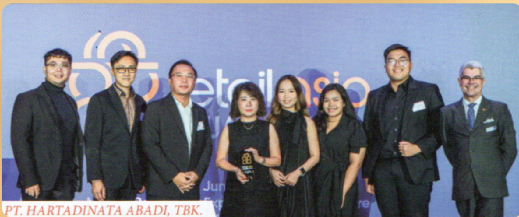
PT. HARTADINATA ABADI, TBK.

Central to Hartadinata Abadi's success is its unwavering commitment to service excellence and customer care